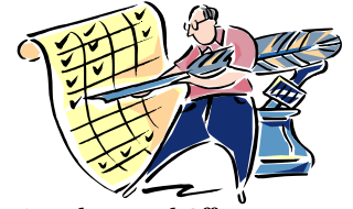
Attendance and Offering Report

March 28, 2010 ~ SS - 37 / Worship - 106 April 4, 2010 ~ SS - 22 / Worship - 154 April 11, 2010 ~ SS - 19 / Worship - 85