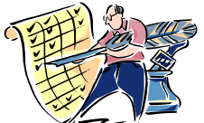
Attendance and Offering Report

October 4, 2009 SS - 27 / Worship - 95 October 11, 2009 SS - 26 / Worship - 77 October 18, 2009 SS - 31 / Worship - 94