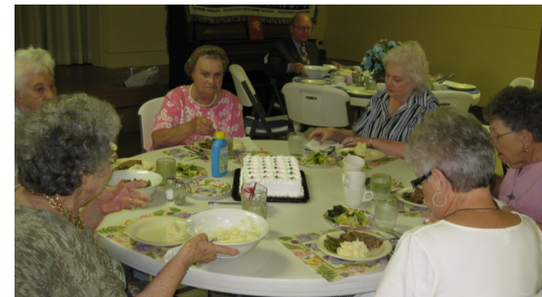
Good Food & Fellowship