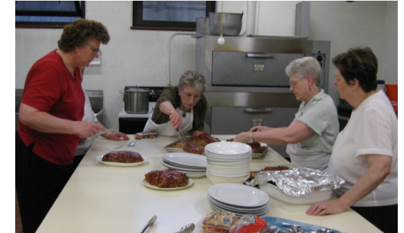
It takes a lot of hands to feed us all.