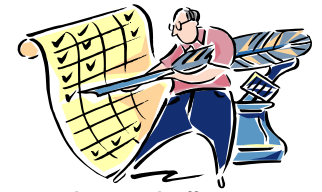
Attendance and Offering Report

March 14, 2010 ~ SS - 27 / Worship - 96 March 21, 2010 ~ SS - 57 / Worship - 66