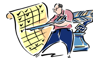
Attendance and Offering Report